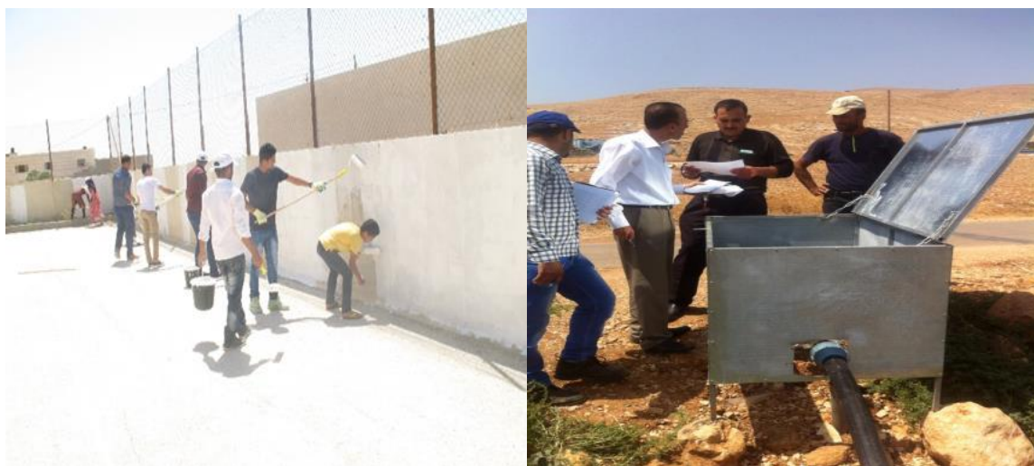
At left: Youth cleaning and painting the school surrounding at one of Area C schools in South Hebron Hills as a result of one of the youth campaigns led by university students, a project implemented by Al Quds Open University At right: Hand-over of water network expansion in Atuf, Tubas in North Jordan Valley with the participation of representatives from the directorate of Agriculture and the village council