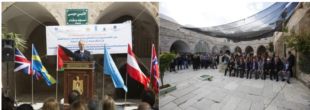
HE Prime Minister Dr Hamdallah delivering a speech during the launching of Round Three on 2 nd of March 2015