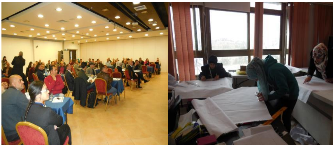
At left: Networking and knowledge sharing workshop on March 23rd 2015

Aiming at strengthening resilience and fostering the transition from humanitarian to development, the third call for proposals was designed and matched with both the findings of the community assessment and national priorities set by partner ministries. During the implementation phase, partner ministries have coordinated with the other actors under their supervision so as to avoid duplication, tracked progress and planned future interventions.