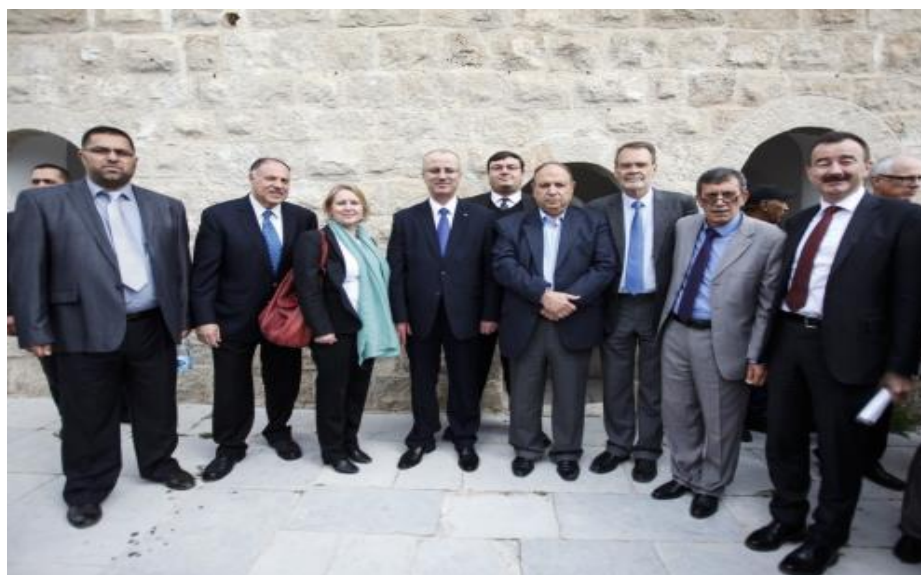
CRDP donors attended the launching event of Round Three on 2 nd of March 2015